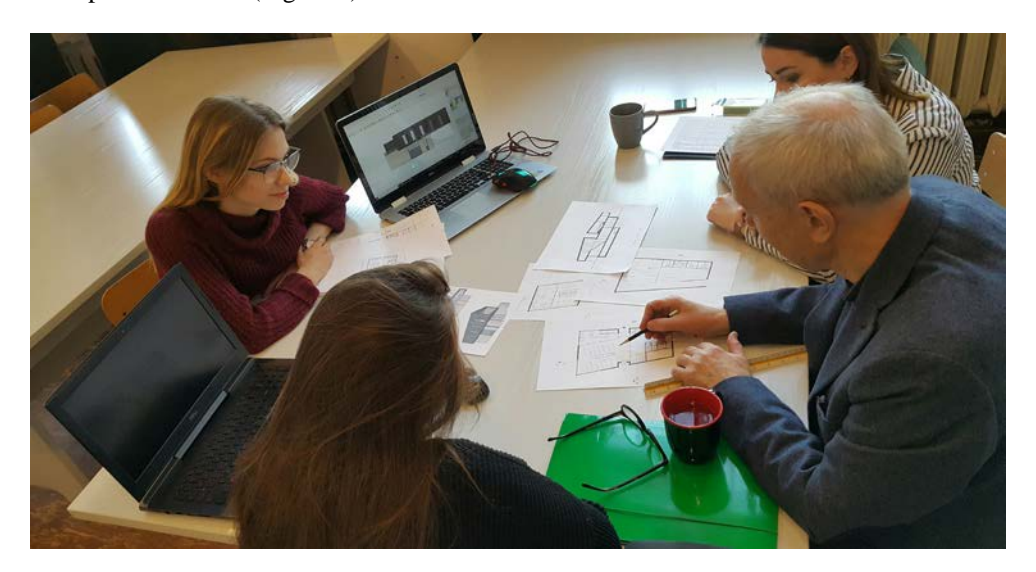
Figure 3: Design class in the Architecture Faculty at Gdańsk University of Technology, supervised by a professor of architecture and supported by a civil engineer tutor.

Education aimed at achieving high-level education in groups focused on design is expected to be conducted by tutors with significant contributions to the development of the discipline: architecture and urban planning; building qualifications in the architectural specialty and professional experience acquired in design practice. Supervision in the design classes group also may be conducted in co-operation with other tutors having professional experience adequate for the scope of activities (Figure 3).